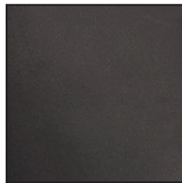
Flat Black (FBK)