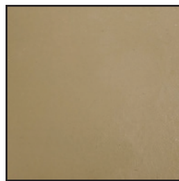
AMS Beige (AB)