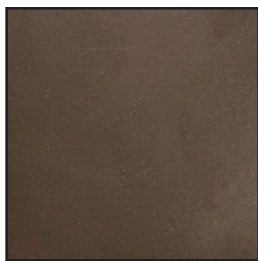
Mineral Bronze (B)

KNC SDL-V90, SDL-FP, SDL-SG Louvers are painted or primed using a VOC-free electrostatic painting process that causes the paint to be attracted to all exposed surface areas of the metal. This method yields a continuous coat of paint both inside and outside of the part providing excellent protection against moisture and dust, giving your product the longest lifespan possible.