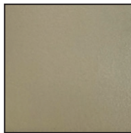
SC Beige (SB)