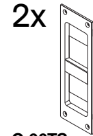
C-90TS Thumb Slide Flush Pull with Short Spindle