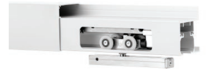
CCL-410 Up to 150 lbs. [68 kg] per door