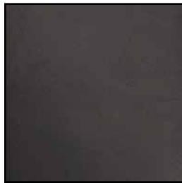
Flat Black (FBK)