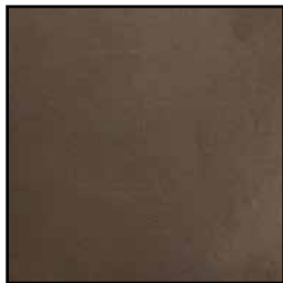
Mineral Bronze (B)

KN Crowder's SDL Louver series are finished using a VOC-free electrostatic painting process, which attracts paint evenly to all exposed metal surfaces. This ensures a uniform, continuous coating – inside and out – for enhanced protection against moisture and dust, resulting in a longer product lifespan.