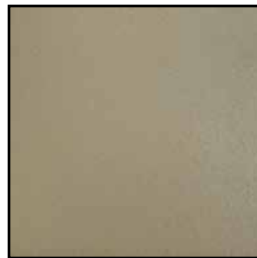
SC Beige (SB)